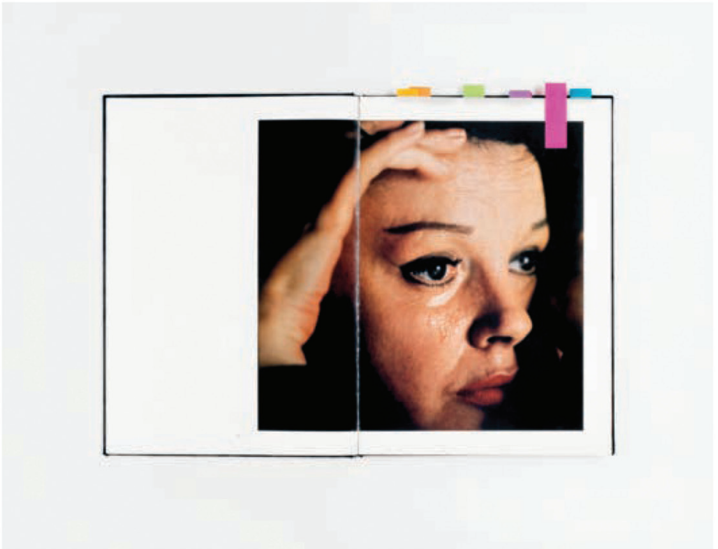
Untitled (Light Years, Douglas Kirkland), 2009, C-print , cm 116.84 x 150