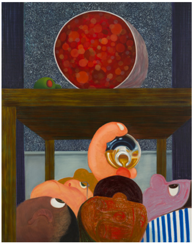
Nicole Eisenman, Under the Table 2, 2014, oil on canvas, 82 \times 65 inches. New Museum.

Throughout "Al-ugh-gories" is a delicious distaste for the myth of the Great White Male Painter. Were-Artist (2007), for example, depicts a Picassoid painter as a horror-movie villain, his brush left dangling between two sharp, furry claws—his art has transformed him into a monster. Ironic as these paintings are, Eisenman is a genuine art-