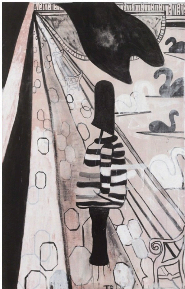
, Rødeflag , 2016. Galleri Bo Bjerggaard

Tal R: There were tons of images. We made a collective pool of images. Painting is serious business. You can not just do what you want. That means that some of the images we used, we both tried to make versions of that image, and sometimes I couldn't do it, or she couldn't. But all of these works come from the same pocket of images—our collective pocket.