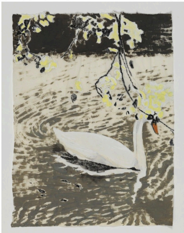
, Glitter , 2016. Galleri Bo Bjerggaard