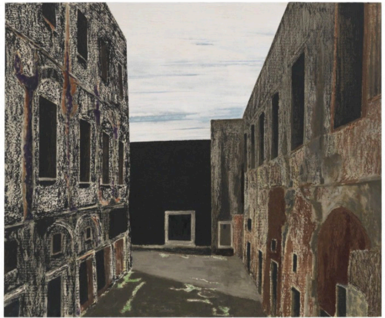
Blind Alley, 2016.