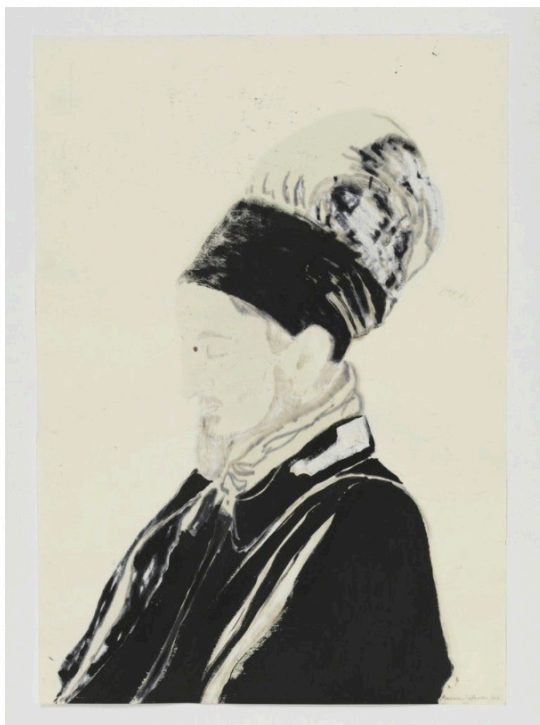
, Stranger II , 2016. Galleri Bo Bjerggaard

Artsy: Your exchange included sending each other photographs. Did some of these photographs form the basis of any of your paintings, or did they serve only as creative inspiration?