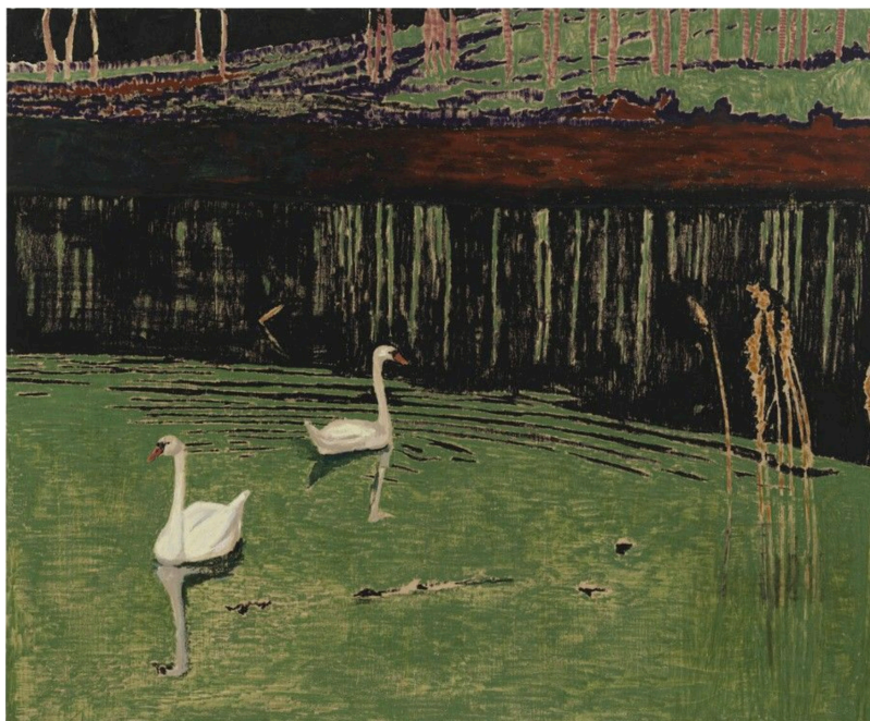
Weekend, 2016. Galleri Bo Bjerggaard

This autumn, two of Scandinavia’s top painters joined forces to produce “Svanesang,” or “Swan Song,” two parallel exhibitions recently on view at Galleri Bo Bjerggaard in Copenhagen and Galleri Magnus Karlsson in Stockholm. Tal R and Mamma Andersson forged this creative exchange by visiting each other’s studio and sending photographs back and forth in what they call a “dialogue through images.” The collection of images then served as inspiration for their individual works spread between the two galleries.