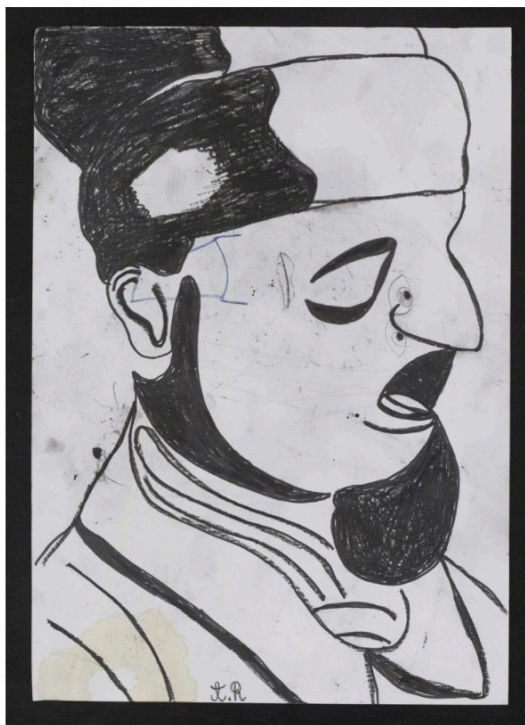
, Saint på broen , 2016. Galleri Bo Bjerggaard