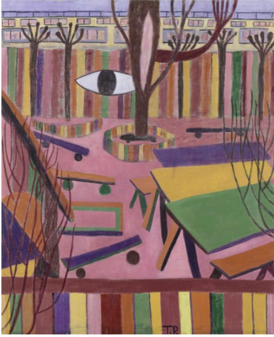
, Deaf Institute , 2016. Galleri Bo Bjerggaard