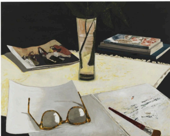
Easter, 2016.

Mamma Andersson: We actually didn't know each other that well before this collaboration. Before this we had