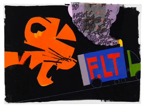
Ellen Berkenblit, Untitled, 2018. Gouache, graphite, and fabric on paper, 11 \times 15 inches.

Rail: Another formal element of your paintings that really stands out is