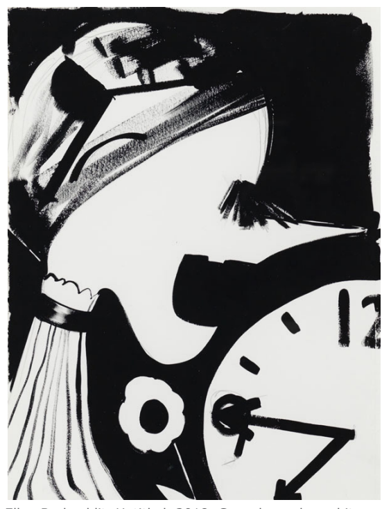
Ellen Berkenblit, Untitled, 2018. Gouache and graphite on paper, 15 \times 11 inches. Courtesy Anton Kern Gallery, New York. © Ellen Berkenblit.

themselves. I appreciated how your body, or rather your "performance" as the artist, is kind of minimized. Instead it's focused on the lines themselves, and on these ambient images from your studio that are cut in.