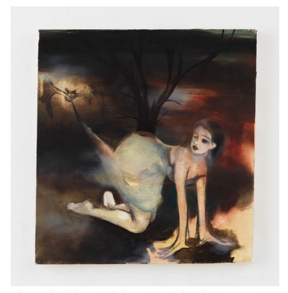
Ellen Berkenblit, Untitled, c. 1993. Oil on linen, 15 \times 14 inches. Courtesy Anton Kern Gallery, New York. \circledcirc Ellen Berkenblit.