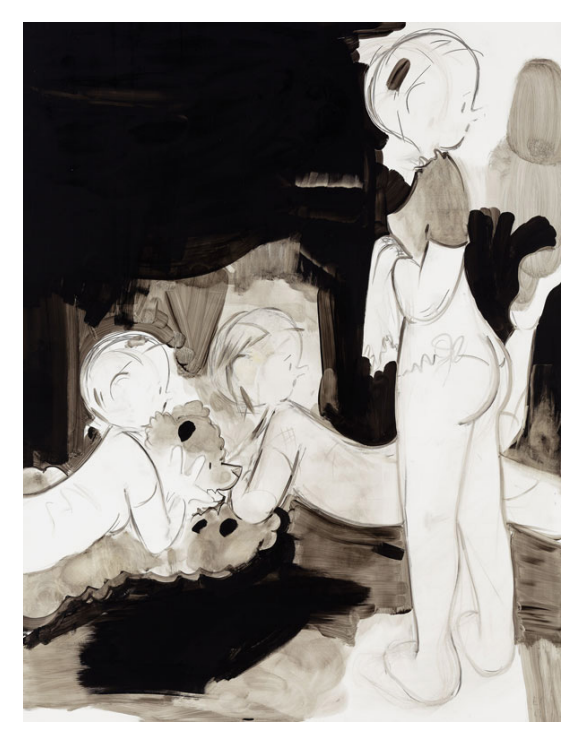
Ellen Berkenblit, Untitled, 2009. Oil, charcoal and pencil on board. 39 \times 30 inches.

Berkenblit: It is. God knows why I need to put my diary on display, but I love the idea of people seeing my work and for it to provide a platform for their Id, their interpretation, their emotions, their storytelling to themselves. That's another reason that I'm so adamant about the fact that they're not self-portraits, they're not people I know, they're not even specifically cats or women. The profiles are all so interchangeable to me. Yes, they're women, I'm not going to be that difficult about that, but they're not specific women. In the film, when I'm doing the big painting, that arm arch that is shown is pretty much the start of everything. It could