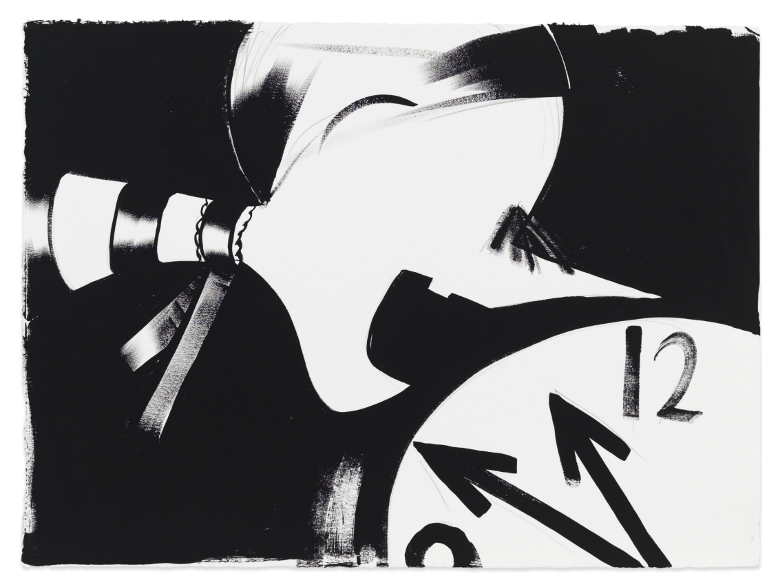
Ellen Berkenblit, Untitled, 2016. Gouache and graphite on paper, 11 × 15 inches. Courtesy Anton Kern Gallery, New York. © Ellen Berkenblit.

ANTON KERN | SEPTEMBER 12 - OCTOBER 20, 2018