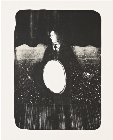
Drummer (2011), 2-color lithograph. Edition: 25. Paper size: 22 x 16-3/4 in. Courtesy: Jungle Press Editions.