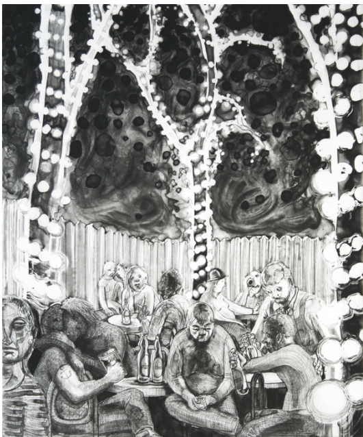
Nicole Eisenman, The Met , 2012, line etching and aquatint with direct gravure on white wove paper, measuring 20 3/4 x 16 1/2 inches. Plate size 15 1/8 x 12 1/8 inches. Printed and published by Harlan & Weaver, New York.

Eight months ago, Nicole Eisenman locked her paints away and turned exclusively to prints. Operating feverishly in four different workshops, both alone and in collaboration, the Brooklyn-based artist has produced a trove of works in various mediums—etching, lithography, monotype and woodcut. Her large, inventive monotypes—colorful works focusing a big head, or on a single figure or two in playful combinations—were her contribution to the most recent Whitney Biennial, often singled out for praise in reviews of the show. Eisenman is currently exhibiting her prints in all mediums at Leo Koenig Gallery in New York, through June 30.