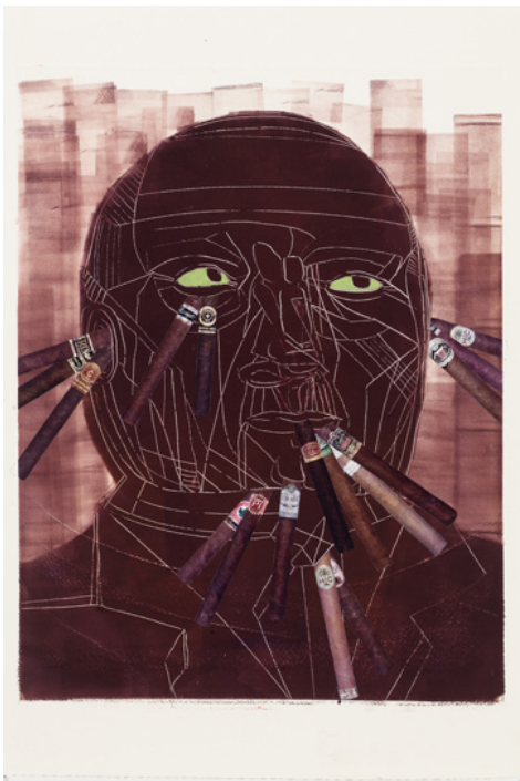
Untitled 2012 Monotype on paper Image size: 24 3/8 x 18 3/4 in (61.9 x 47.6 cm) Frame size: 28 1/2 x 23 1/2 in

Anything. It's a good old-fashioned women's collective, really well run, with really good equipment. I made the monotypes I'm showing at the gallery there. The ones at the Whitney I did in Brooklyn on a press I rented from [artist and master printer] Lothar Osterburg.