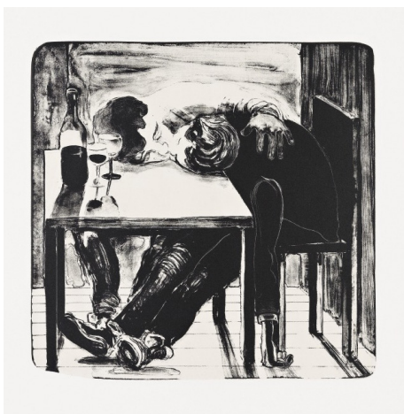
Sloppy Bar Room Kiss (2011), 2-color lithograph. Edition: 25. Paper size: 18 x 17-7/8 in. Image size: 12-5/8 x 13 in. Courtesy: Jungle Press Editions