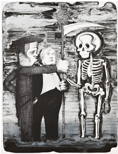
Tea Party (2012), two-color lithograph. Edition: 25. Paper size: 48-3/4 x 37-1/8 in.

EISENMAN: I did those myself at the amazing Women's Studio Workshop in Rosendale, in upstate New York. I rented time on their press. It's a women's collective, just beautiful. Anyone can go there, and they give grants to some people so they don't have to pay