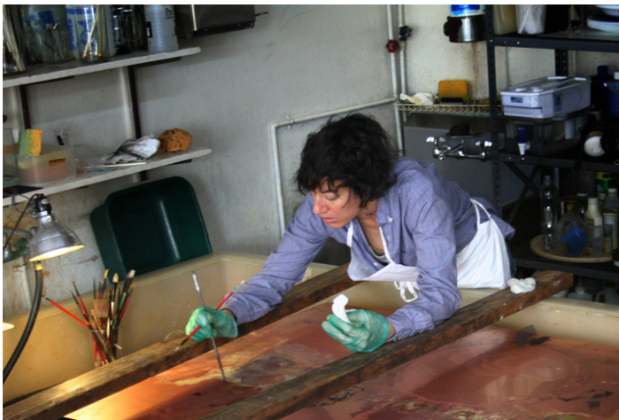
Nicole Eisenman working at Harlan & Weaver, New York