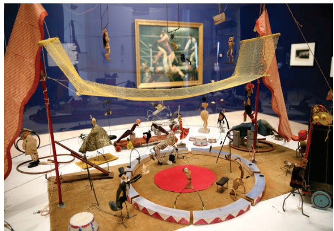
Alex Brown's painting "Pilgrim" (2012) appears abstract up close but from a distance resolves into the image of a hippie.

Each is memorable for beauty, rarity or oddness. Together they demonstrate how truly unmappable the borders of American modernism are, a fact that the curators emphasize by avoiding fixed categories in their groupings. They shuffle painting,