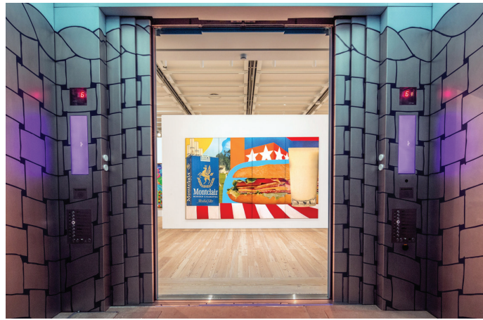
An elevator designed by Richard Artschwager.