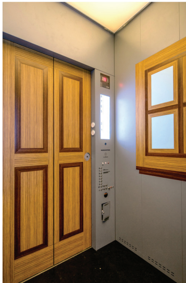
Passenger elevators at the Whitney were designed by Richard Artschwager and have the look and feel of individual sculptures.

Nowhere directly addressed are the Whitney's own identity issues, embedded in its very name. This isn't a museum of American art. It's a museum of North American art. The curators are well aware of this, and sometimes use the phrase "art of the United States." But the exclusion remains: Latin American art, art of the Americas, is all but absent here, with the Cuban-born painter Carmen Herrera, 99, being among the outstanding exceptions. (She will have a solo show in 2016.)