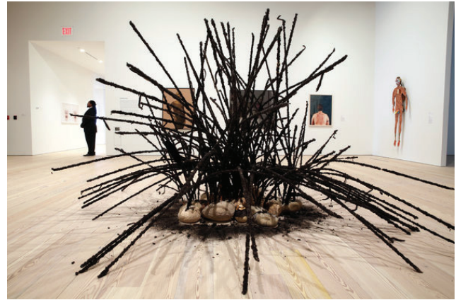
David Hammons's "Untitled." Gallery, New York