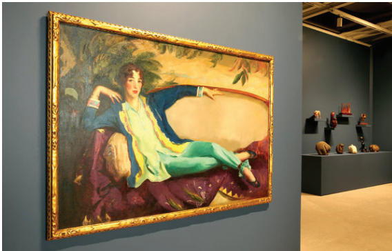
Robert Henri's 1916 portrait of Gertrude Vanderbilt Whitney, the museum's founder.

— moves up to the eighth floor and unfolds there with European-influenced abstraction, a kind of art that Mrs. Whitney was slow to warm to. She collected some: Stuart Davis's 1927 "Egg Beater No. 1" was hers. But the great Marsden Hartley works that open this section, radiating the color and clamor of World War I Berlin, came to the museum after her death, as did a big composition of google-eyed swirls by the poet E. E. Cummings, one of many novelties hauled out of deep storage.