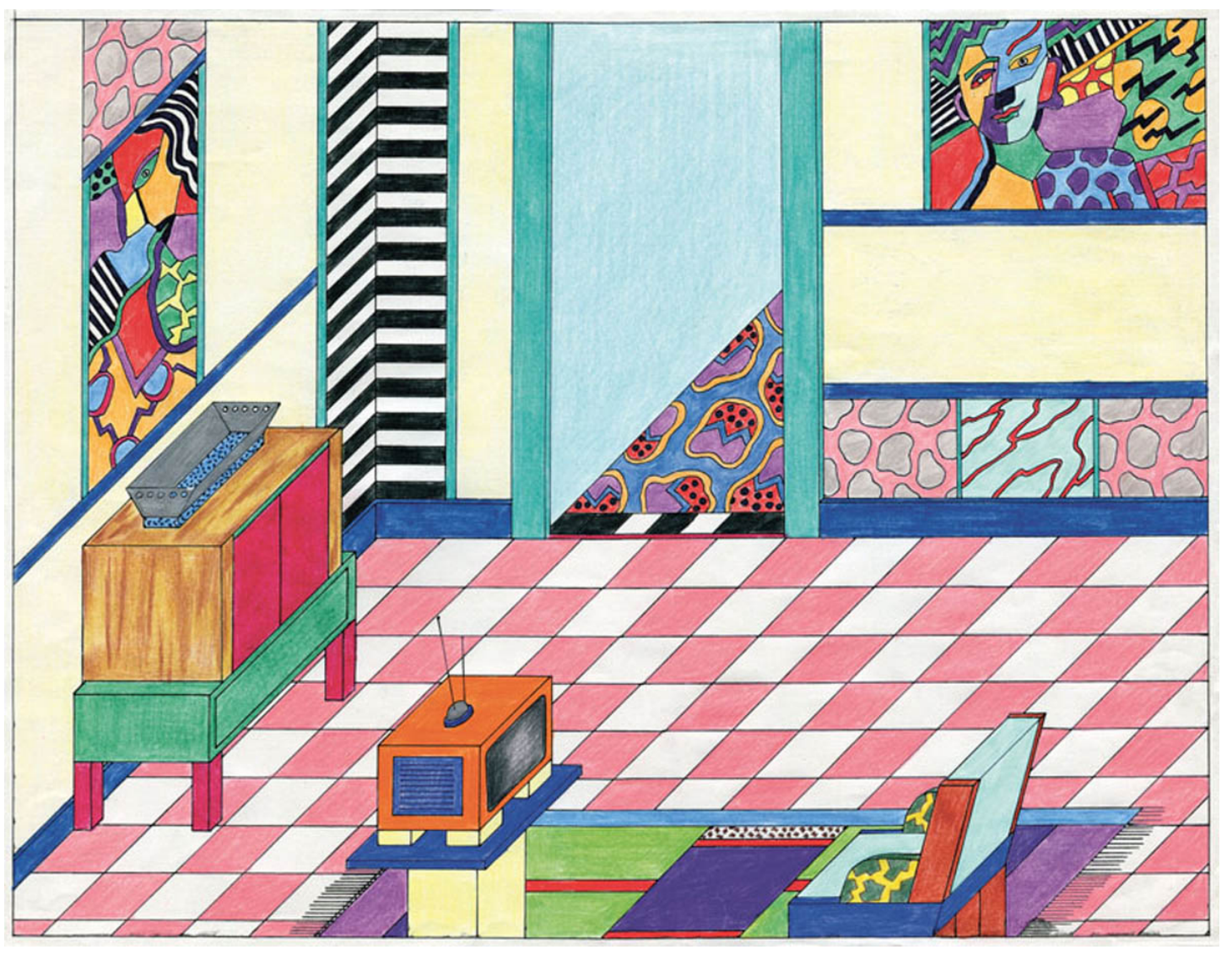
One of a series of drawings in which Du Pasquier experiments with several surface treatments—on the floor, walls, and furniture of a living room—to enliven a domestic setting. Influenced by Pompeian wall paintings, Du Pasquier designed decorative panel inserts that had a perceptual effect on the viewer. "There is this pleasure of breaking the wall with a false view," she says.