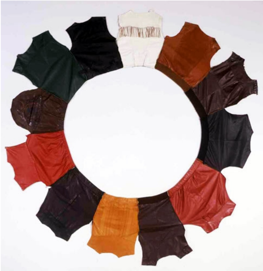
Leather jackets and Velcro 95" diameter 241 cm diameter (AK#1065)