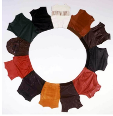
Jim Lambie Digital (New York) , 1999 Leather jackets and Velcro 95" diameter 241 cm diameter (AK#1065)