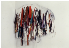
Jim Lambie Since , 2000 Belts, plexiglass, tape 44" x 53" x 10" 112cm x 134 1/2cm x 25 1/2cm (AK#1067)