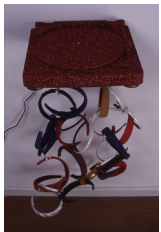
Jim Lambie Mobile Disco , 1999 Record deck, glitter, wire, tape 37 x 18 1/2 x 16 ". 88cm x 42cm x 40 1/2 cm (AK#1062)