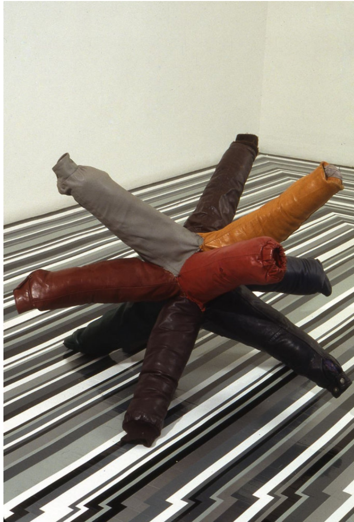
Leather, wadding 24" x 36" x 38" approx (AK#1064)