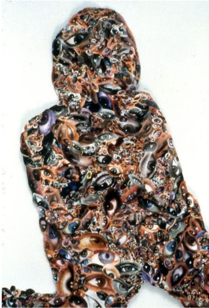
Collage 64 x 62" 162 1/2 x 157 1/2 cm (AK#1061)