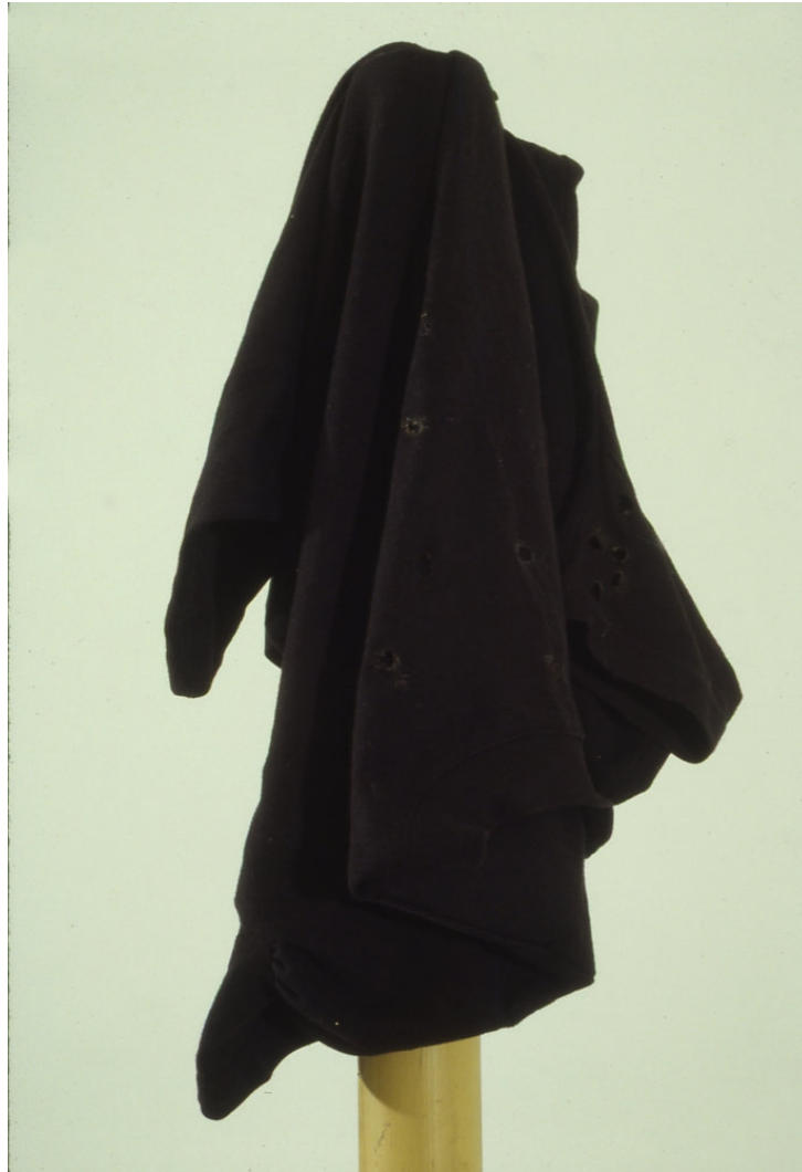
Bamboo, T-shirt 71 " high, 180 1/2 cm high (AK#1069)