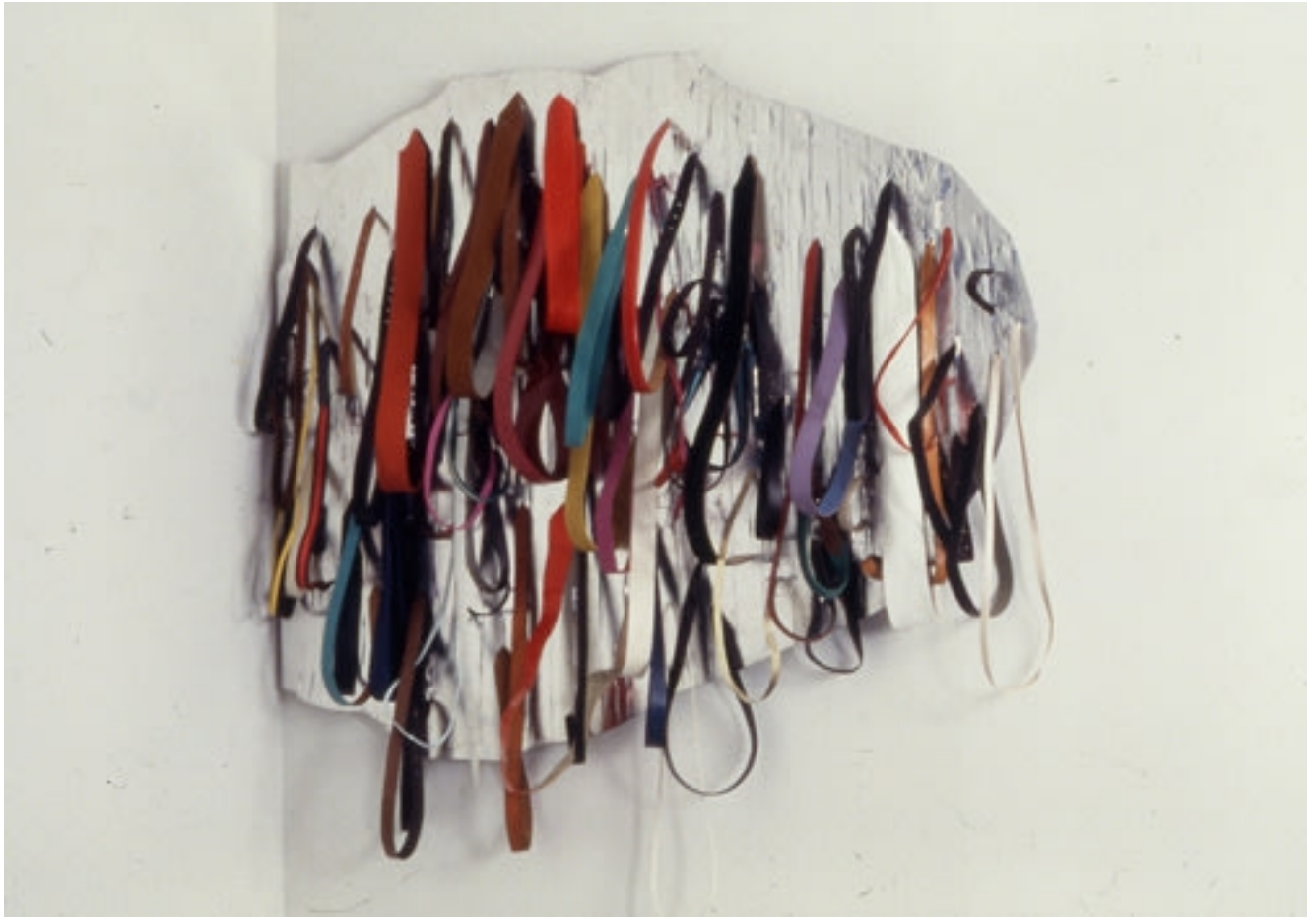
Belts, plexiglass, tape 44" x 53" x 10" 112cm x 134 1/2cm x 25 1/2cm (AK#1067)