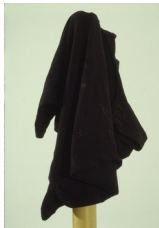
Jim Lambie Ultralight , 2000 Bamboo, T-shirt 71 " high, 180 1/2 cm high (AK#1069)