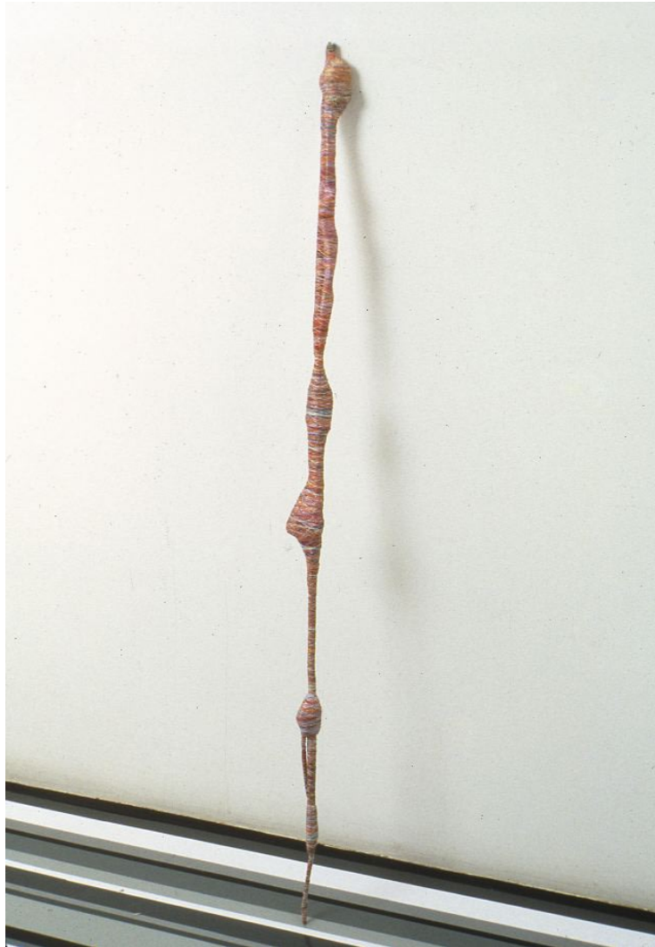
Bamboo, thread, paper, wire 44" high, 112cm (AK#1060)