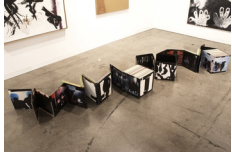
Jim Lambie Stakka Record Covers , 1999 Record covers, tape, acrylic paint Dimensions variable (AK#1066)