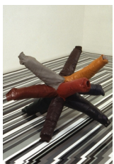
Jim Lambie Leatherette , 1999 Leather, wadding 24" x 36" x 38" approx (AK#1064)