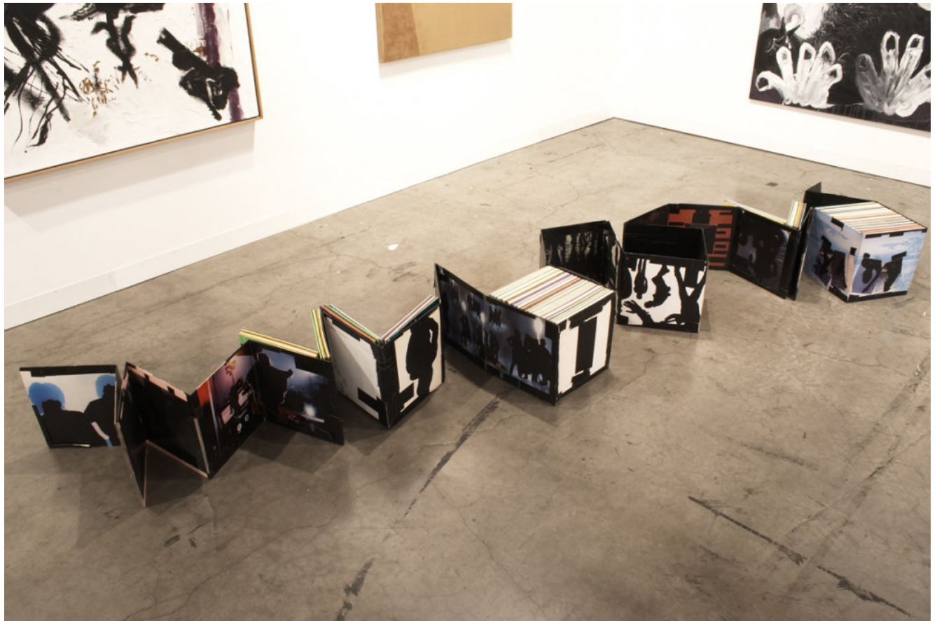
Record covers, tape, acrylic paint Dimensions variable (AK#1066)