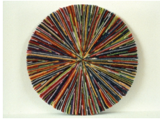
Jim Lambie Contact , 1999 vinyl record, wool 12" diameter (AK#1050)