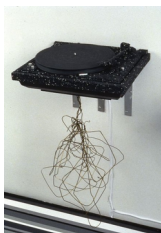
Jim Lambie Garage , 1999 Record deck, glitter, wire, tape 37 x 18 1/2 x 16 inches 88cm x 42cm x 40 1/2 cm (AK#1063)