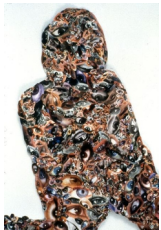
Jim Lambie Supernature , 1999 Collage 64 x 62" 162 1/2 x 157 1/2 cm (AK#1061)