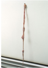
Jim Lambie Psychedelic Soul Stick , 1999 Bamboo, thread, paper, wire 44" high, 112cm (AK#1060)