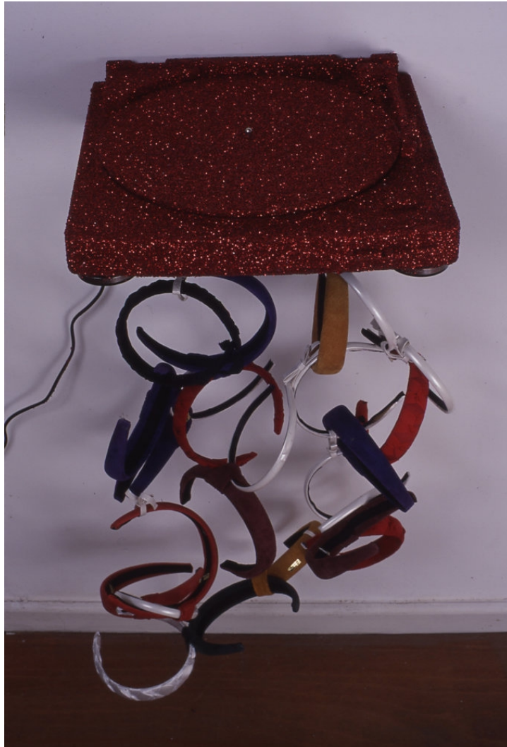
Record deck, glitter, wire, tape 37 x 18 1/2 x 16 ". 88cm x 42cm x 40 1/2 cm (AK#1062)